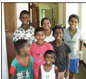
Photo: The kids at St Anthony's